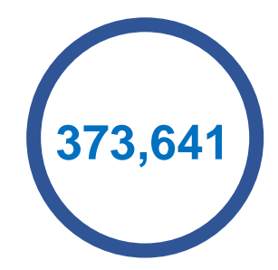
Post reach per week