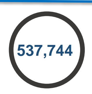
Likes on Facebook