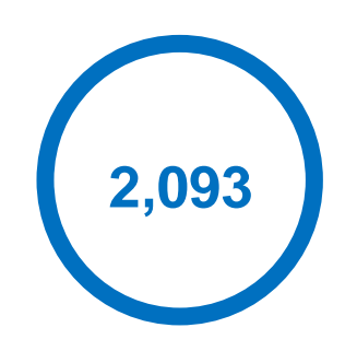
Number of Likes per week