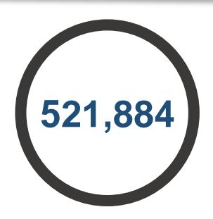
Likes on Facebook